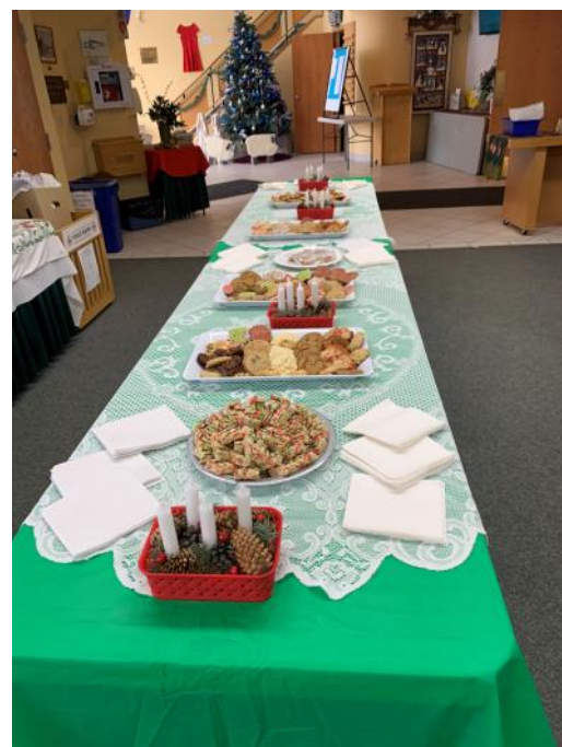
Carols and Cocoa, December 2022